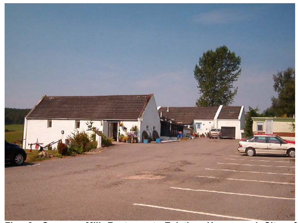
Fig. 2. Craggan Mill Restaurant, Existing House and Site of Proposed House on Site of Caravan

1. The site of this application is located within the grounds of the existing established Craggan Mill Restaurant and Gallery. The property is positioned outwith the settlement boundaries of Grantown-on-Spey on its south-west side in a countryside location but immediately adjacent to the A95. On site at present is the converted mill which accommodates the restaurant and gallery, and is a traditional white harled building with tiled roof, originally dating from, as I understand it, the 18<sup>th</sup> century. It has an extension to the rear. Also to the rear is a single storey house (in separate ownership) which has been designed to complement the characteristics of the former mill. The site slopes in a west to east direction down to the trunk road. Car parking areas are located to the front and there are some garden areas on the south side of the site. There is direct and separate access from the A95. The site is surrounded by open agricultural land.