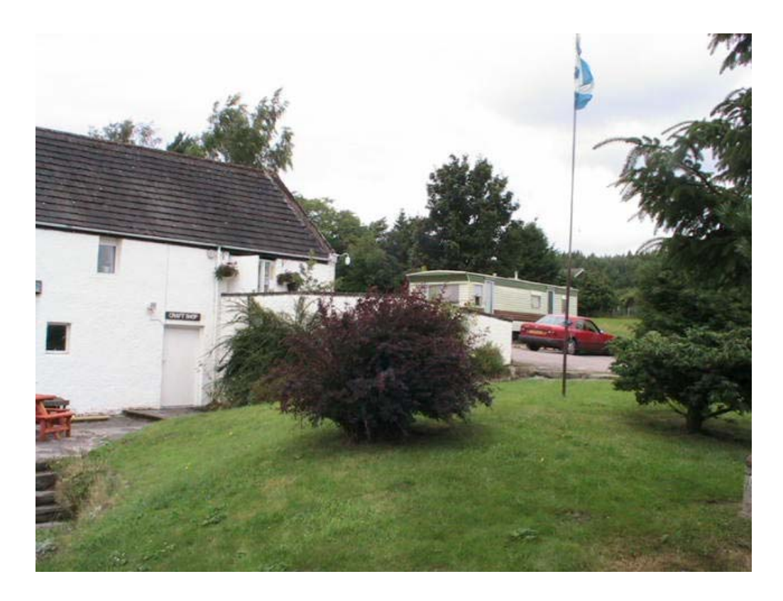
Fig. 3. Craggan Mill Restaurant and Site of Proposed House on Site of Caravan

3. The proposal is to erect a new permanent dwellinghouse for the owners of the restaurant. They purchased the business in 2004 but the previous owners decided to remain in the existing house to the rear. This meant that no house was available for the applicants, hence the need for the temporary accommodation. The proposed house is to be positioned on the north side of the restaurant (site of caravan) with access maintained to serve the existing house to the rear. A new combined septic tank and soakaway for the proposed and existing houses is proposed but the restaurant will continue to be served by its own private drainage treatment system.